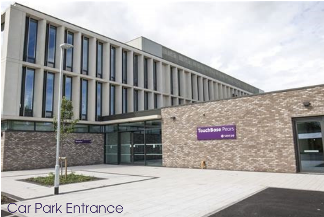
Car Park Entrance

Car Park Entrance – As you face the front of the building on Bristol Road, this is on the right-hand side.